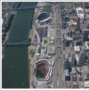
Overall Cincinnati Central Riverfront development