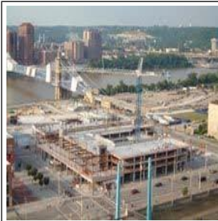
The Banks 'underbuild' complete (2010)