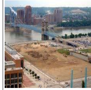
The Banks moves from a 'project on paper' to reality (2008)