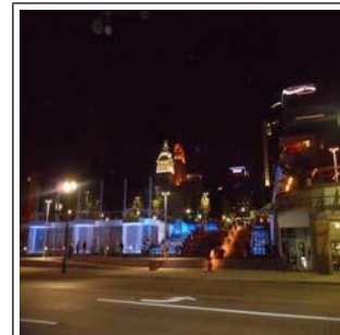
Nighttime close-up of the Walnut Street Fountain and stairs