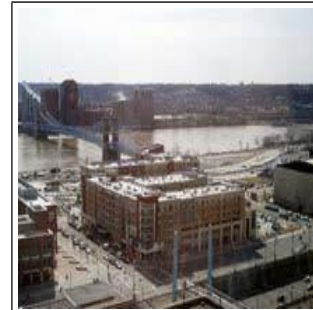
The Banks private development (2011)