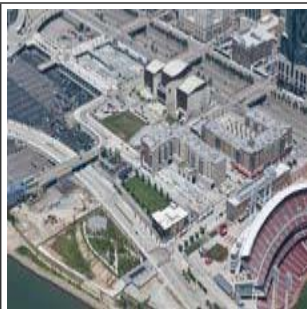
Riverfront development from the southeast