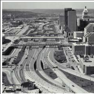
Fort Washington Way pre-reconstruction (1998)