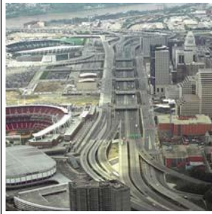
Reconstructed Fort Washington Way (2005)