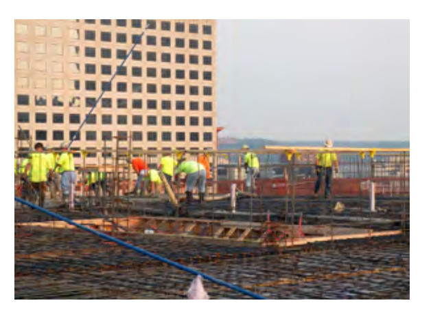
Workers prepare for the final concrete pour on the GE Building.

All Public Parties construction work remained on schedule through June 30, 2015.