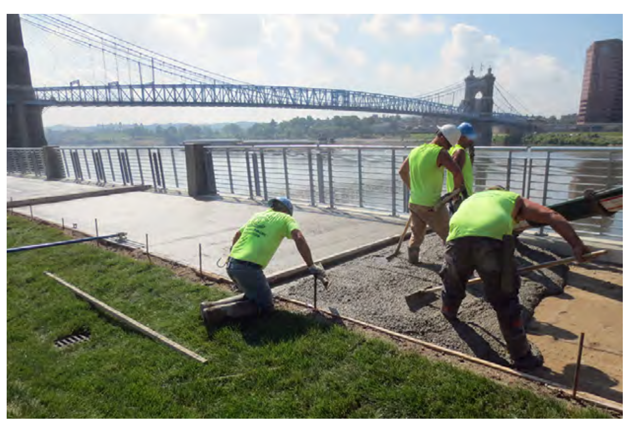
Workers smooth the fresh concrete along the Ohio River Walk.