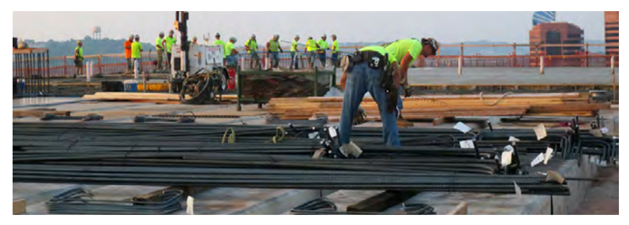
GE Building top deck construction ('all hands on deck').