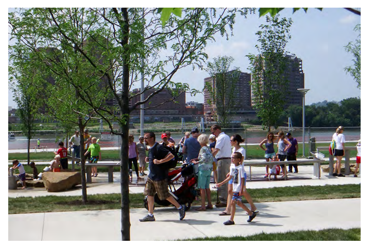
Crowds of visitors enjoy Smale Park on a sunny June afternoon.