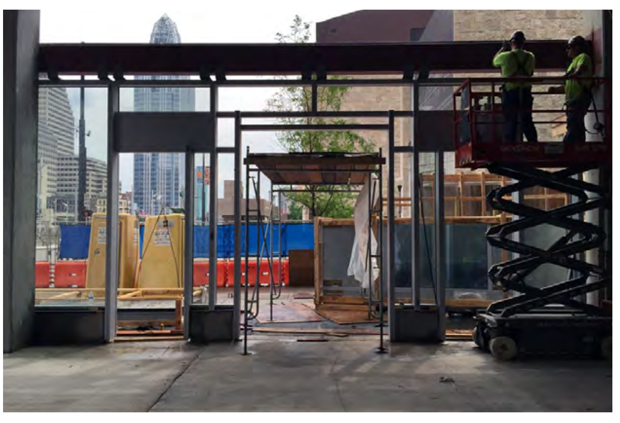
Glass is installed in the GE Building lobby.

Construction crew members worked a total of 308,049 hours without a lost-time incident April 28, 2014 through June 30, 2015.