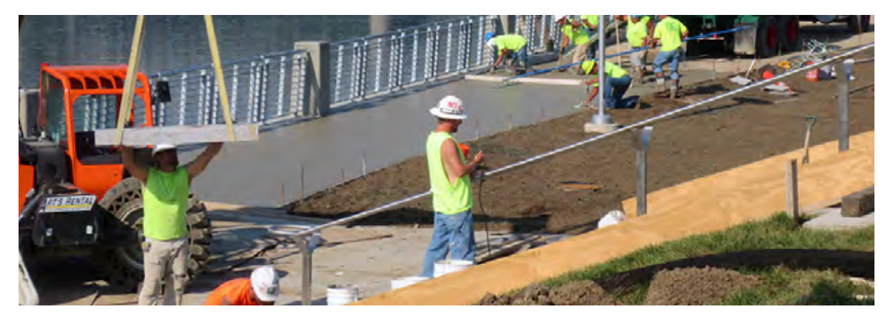
Crew installs granite steps and executes a concrete pour for the Ohio River Walk.

• TIGER Funds application was submitted for Phase IIIB, C, and Phase IV of the intermodal Transit Facility.