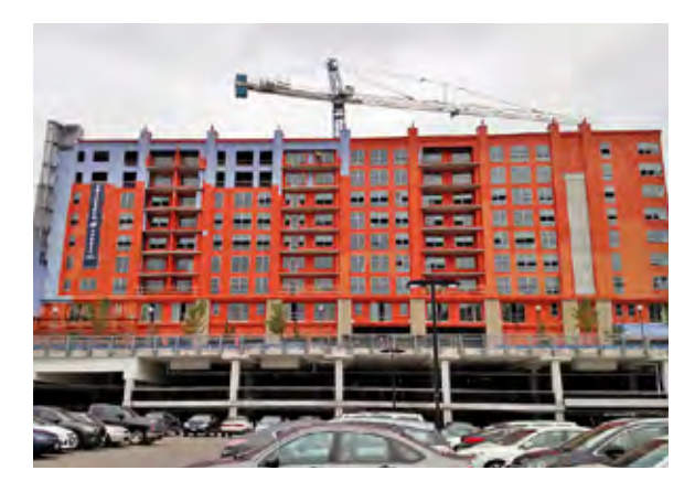
Apartment structure exterior skin cladding installation is underway.