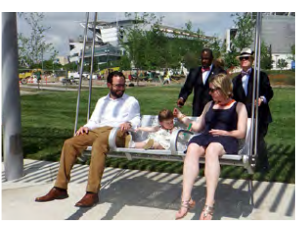
Rosenberg Swings opened west of the Roebling Bridge.

• Smale Riverfront Park leadership sends congratulations and thanks to its construction team, Parks staff, project partners, and donors for a 'job well done' and for making this project a success. Smale Riverfront Park was a mere vision in 1997 a vision that has now become a reality that will be enjoyed by the local community and visitors to the City of Cincinnati for decades to come.